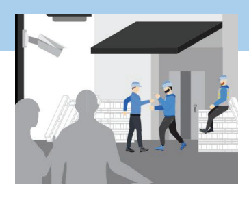
Door propped in restricted area outside the facility; alert sent to security.