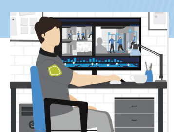
Security alerted to individuals loitering outside the propped door.