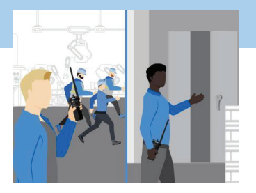
Loiterers are located and incident is logged, allowing for further training and analysis.

Orchestrate alleviates the requirement of someone having to be in the command center / video wall to receive a notification of a potential threat. Intelligence and notifications are automatically shared beyond the command center and into the field where they can quickly be acted upon.